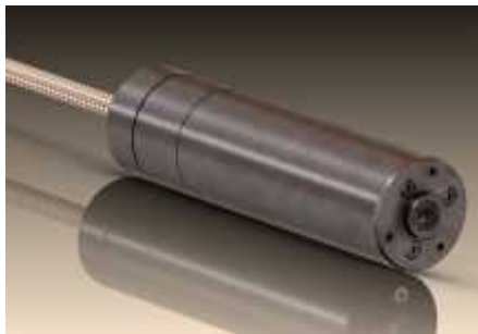
High Power Fibre Coupled Isolator